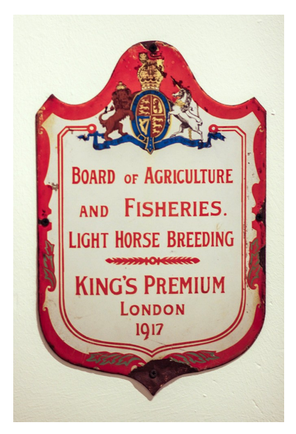
King's Premium Stallion Plate

The story behind these things makes them much more interesting. There is a King's Premium plate which was first established after the Boer War to encourage people to breed horses because of the great shortage after the war. This evolved into the Hunter's Improvement Society, again because of the shortage after WW1, and with the changing times has finally become the Sport Horse Breeding Society now to encourage international trade in competition horses.